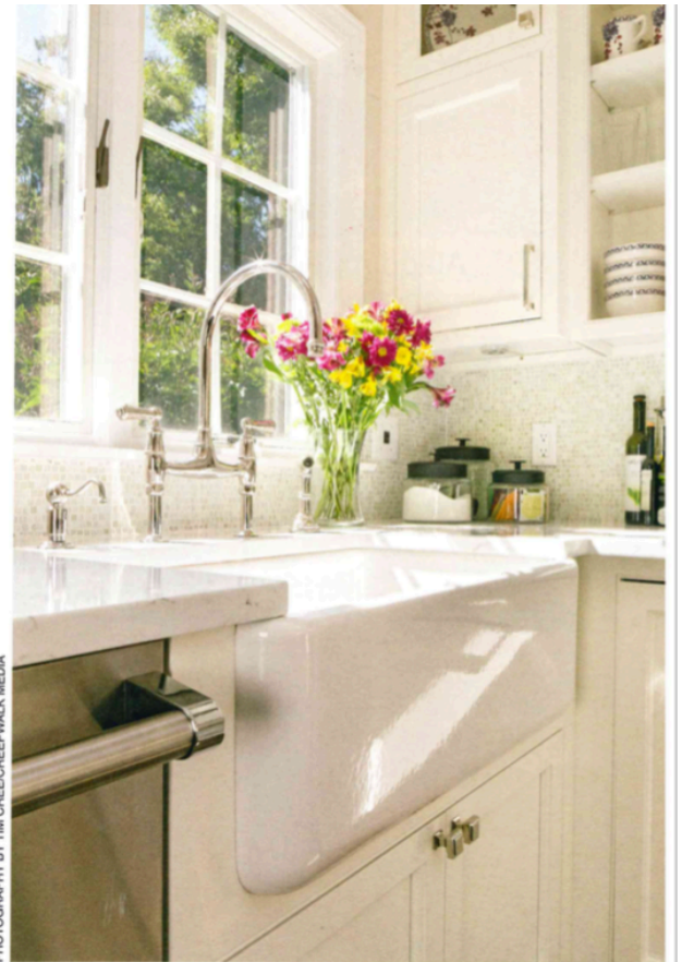
"The Blanco farm sink was a no brainer," explained the homeowner. Rohl faucets were selected to complete the country look.