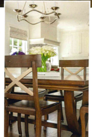
The chairs were customized with a specialty finish to highlight the "x" in these solid wood dining chairs. The table was sized specifically to the client's space to maximize seating.