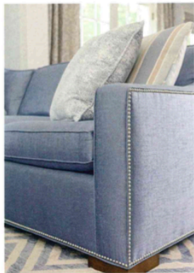
This sectional was custom made by Marlaina's "to the trade" workroom. The Garvins' were invited to a "fitting" so that the depth, pitch and comfort of the seat would be perfect for their specific heights and builds. Small brushed nickel nail heads border the arms and base.