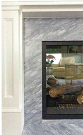
The Bardiglio Gray Marble surround has just the right amount of color and movement and works perfectly in both rooms on either side of the fireplace.

portioned "clubroom" allowed for more space in the family room and kitchen as one connected contemporary space.