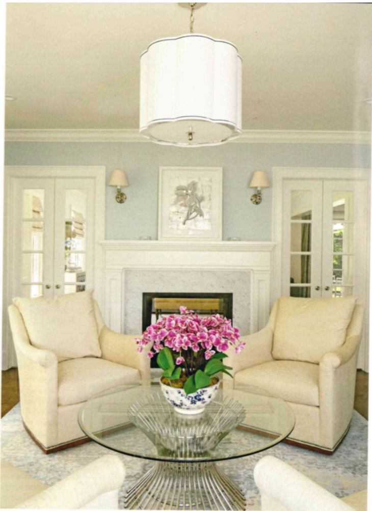
French doors and a two sided fireplace add architectural detail and perfectly divide the previously long rectangle space into a living room and a family room.