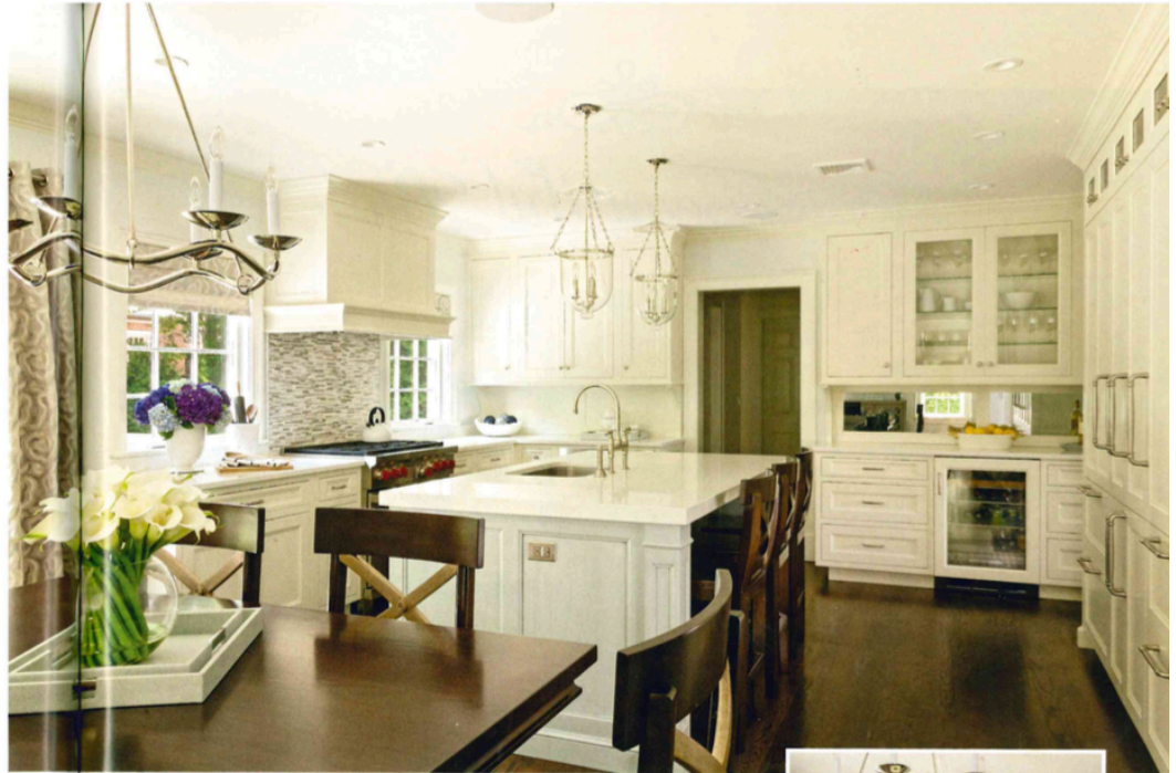
The Jacobean stained oak floors provide a warm contrast to the crisp white cabinetry from Showcase Kitchens and served as a jumping off point for the finish selections of the Old Biscayne table, chairs and island counter stools. Brushed nickel light fixtures and hardware add just the right amount of sparkle.

One favorite touch is the expansive kitchen, designed with Showcase Kitchens of Manhasset, that pours out directly into the fam-