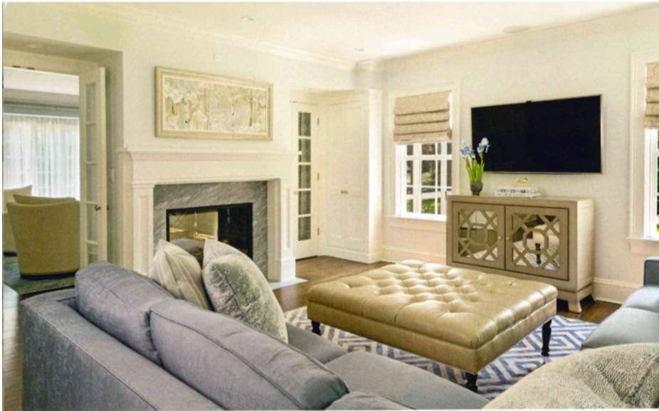
The exquisite Stroheim fabric on this custom designed sectional was treated with an extra layer of protection for heavy family room use. The button tufted cocktail ottoman serves as extra seating as well as a place to put books, snacks or ones' feet up. The material is anti-microbial and easily wipes up in case of spills or dirty fingerprints. The diamond patterned area rug adds a playful element to the space. The cabinet beneath the TV was custom sized to fit between the two windows.