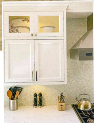
Pompai glass half pearl tiles were used on the backsplash to give movement and create a beachy, country feel.

Showcase Kitchens mixes modern elements with rustic touches